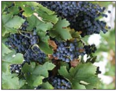
Stan Shebs, F1002/Flagstafffotos

Nonprofit U.S. Postage PAID San Francisco, CA Permit No. 8285